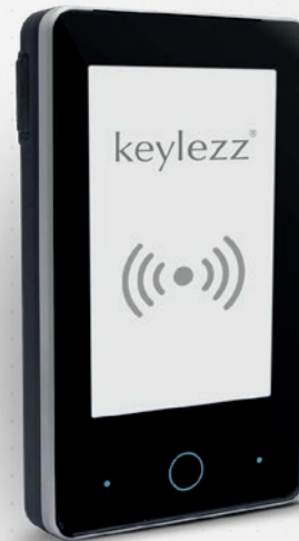
Keylezz® Update Terminal for selecting or automatically assigning the lockers and the authorization period. Optionally also with coding function for applying the application to the card for the first time.