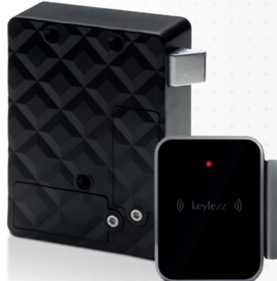
Keylezz® Fallenschloss optional with external antenna