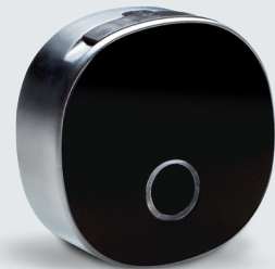
Keylezz® Turn „Biometrics“ (fingerprint)