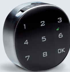
Keylezz® Turn 4-stelligen Code vergeben