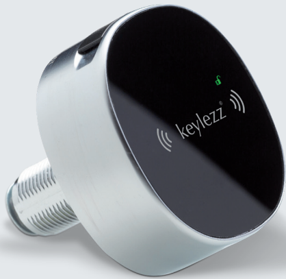
Patented furniture lock

Electronic furniture locks – Keylezz® Turn Multiflex Item number: 5806700