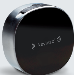
Keylezz® Turn Includes all basic functions

Keylezz® Turn – available in three variants